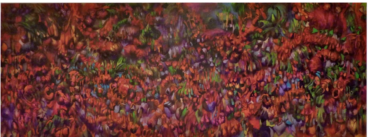
POPAY, Untitled, 2010, mixed media on canvas, 70 x 200 cm