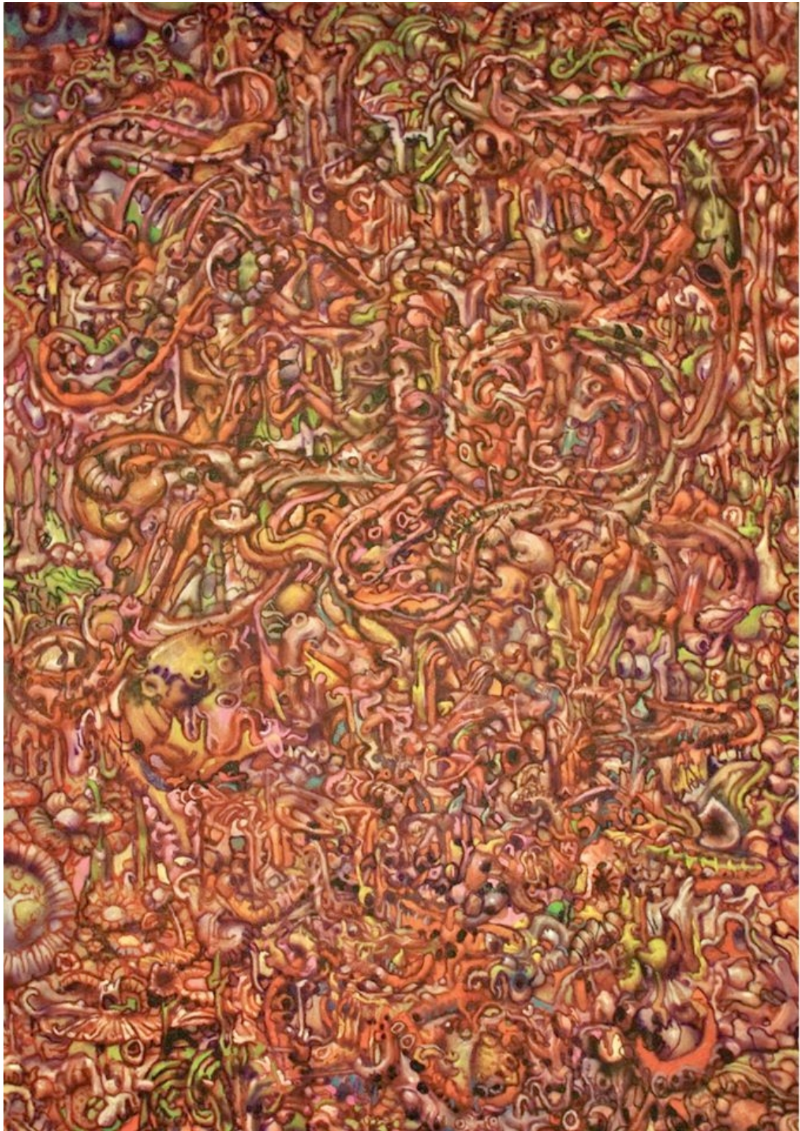
POPAY, Alphabet, 2008, mixed media on canvas, 146 x 114 cm