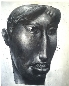
POPAY, Untitled serie, 2016, acrylic on paper, 70 x 50 cm