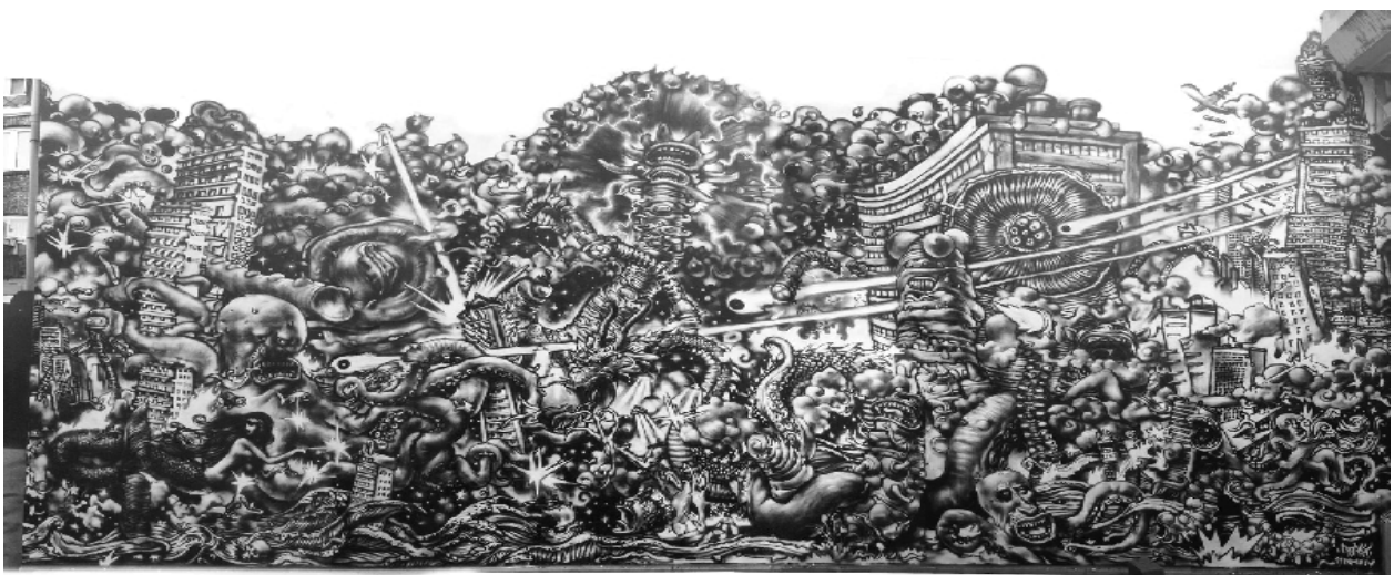
POPAY, mural, 2015, 4 x 12 m, Liège, Belgium