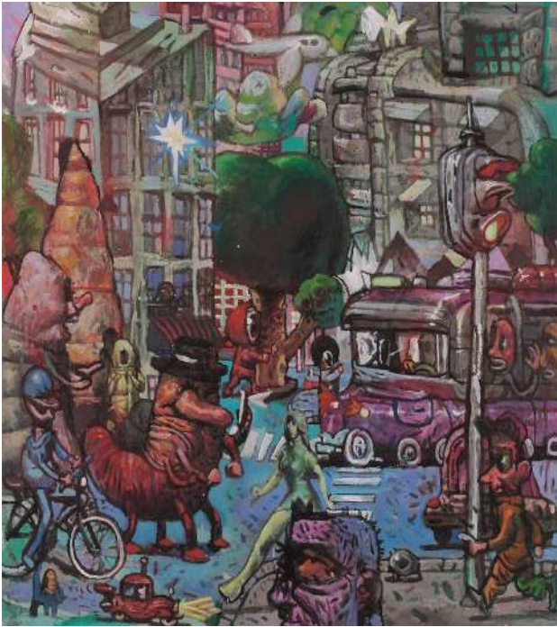
POPAY, Le ver à l'iPad, 2013, acrylic on canvas, 60 x 60 cm

His artwork is diverse, generous, dense and intense. Despite an elaborated painting technique, his work stays spontaneous and emotional, the gesture being essential to the artist. The artist mixes realism and fantasy and creates disorienting, chaotic scenes, with narrative to be read and many details to be discovered in most of his works. His universe invites us in an organic jungle of colors and biomorphic volumes, populated by strange creatures, mostly stemming from dark fairy tales. His human, big headed figures with small limbs are expressive and disturbing. His imagined scenes are disconcerting, placing life of the physical as well as the social body in the focus of his work. The painter is using dark and accented rings, creating sculptural volumes in a range of dense and powerful colors - dominated by blue, green, red, orange and purple -, his scenes end up in luxuriant, seemingly screaming combinations. POPAY's scenes are challenging for the viewer, the mind needing some time to decode the sense of the pictures in order to discover all the elements and decrypt every detail.