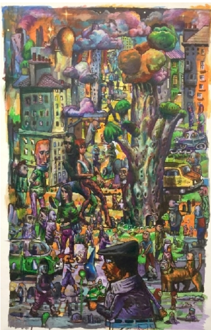
POPAY, Untitled, 2013, acrylic on canvas, 100 x 60 cm