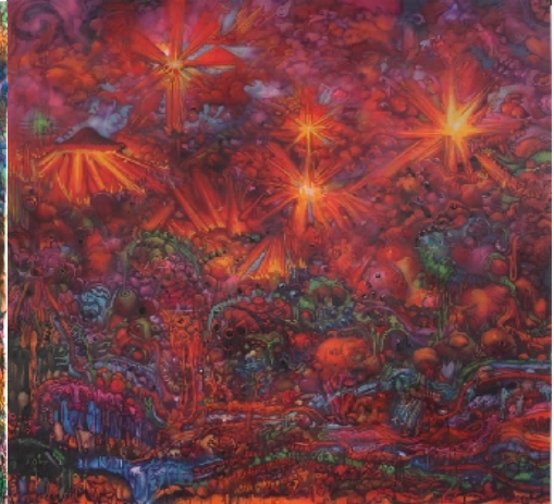
POPAY, Explosion, 2008, mixed media on canvas, 200 x 200 cm