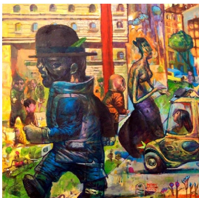
POPAY, Plume verte, 2013, acrylic on canvas, 80 x 80 cm