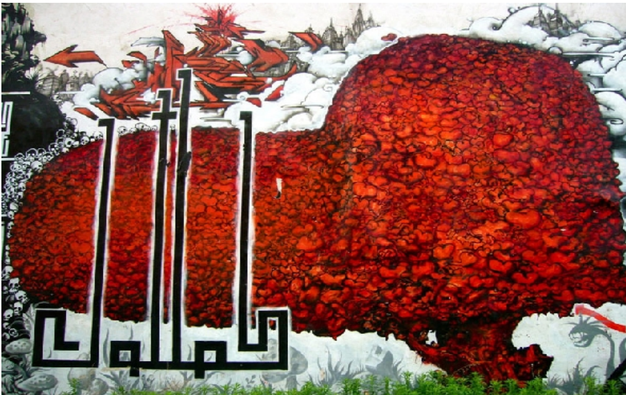
Popay & L'Atlas (Paris, 2012)